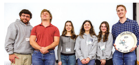
> 2024 Blue Crab Bowl winners Broadwater Academy.

The Blue Crab Bowl is a cooperative effort between VIMS and Old Dominion University's Department of Ocean and Earth Sciences. Over the course of this year's event, more than 55 VIMS faculty, graduate students, and staff volunteered their time to ensure the event's success.