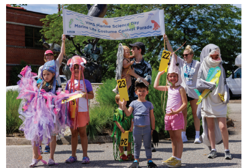
> Several young attendees dazzled with unique outfits in the Marine Costume Contest and Parade.

"Over the course of the day, over 2,000 people were able to get a closer glimpse at the impact VIMS has on the lives of our citizens, including many school-age children and young adults who we hope will be able to better visualize themselves as ocean lovers and marine scientists, and who may help solve the problems facing our oceans and other aquatic habitats in the future!"