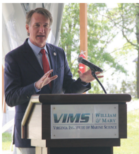
> Governor Youngkin speaks at VIMS about oyster restoration in the York River.

The event marked a significant milestone in Maryland and Virginia's ongoing partnership resulting from the 2014 Chesapeake Bay Watershed Agreement, which established a 2025 deadline for the restoration of oyster habitats in 10 Bay tributaries in Maryland and Virginia.