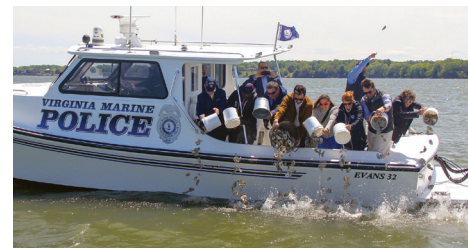
> Participants celebrate restoration efforts by scattering signed oyster shells over the restored reef.