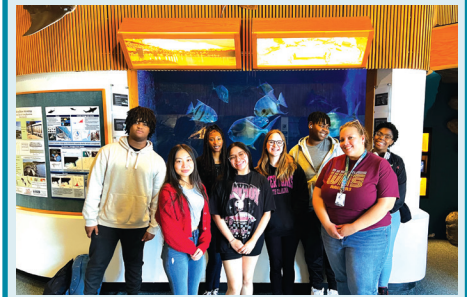
> The visitor center is popular among students and other visitors.

VIMS is raising funds for renovation of its popular, 40-year-old visitor center in Watermen's Hall on our Gloucester Point campus. As VIMS' "front door," the visitor center welcomes thousands of visitors from across the Commonwealth and around the country. Students, teachers, families and individuals of all ages come to VIMS to learn more about the Bay and VIMS' essential research. The Cabell Foundation has awarded a 1:1 challenge grant, providing $400,000 once $400,000 is raised (with a deadline of 12/31/24). Gifts can be made to the Visitor's Center Enhancement and Maintenance Fund (5486) at VIMS.edu/giving . Thank you for making a contribution today! Your support is needed.