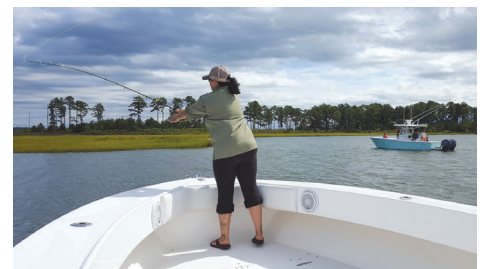
> An angler casts her fly line near a marsh in Virginia's Middle Peninsula.

With funding from the National Oceanic and Atmospheric Administration